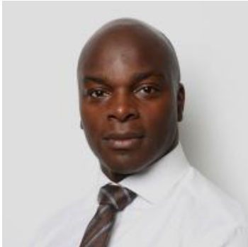
Shaun Bailey AM Chair of the Police and Crime Committee

Sadiq Khan Mayor of London Greater London Authority (Sent by email)