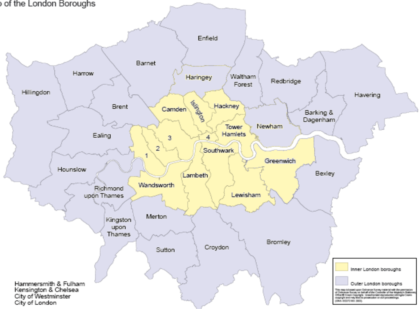
Map of the London Boroughs