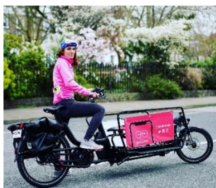
Figure 1: models of cargo bikes and micro-electric vehicles