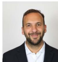
Zack Polanski AM Greens